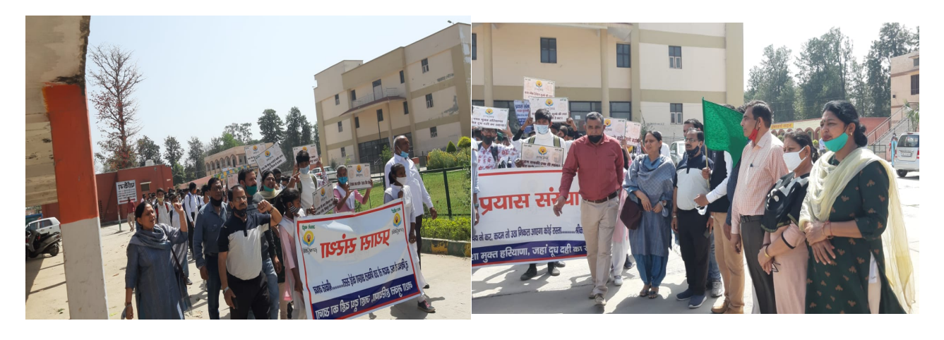
Students Police Cadet Core