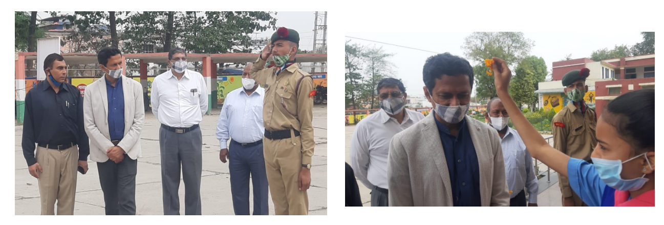
National Cadet Core

Student's Government is the backbone of our school. Student's cabinet is formed in the school every session and it is directly concerned with Principal. In student's cabinet, there is participation from each class/wing. The students are free to share the requirement and suggestions for the betterment of the school.